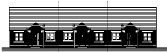
Plots 17, 18 & 19: Bungalows Front Elevation Fink with stone bands & 1/2 1/2 long with 1/2 windows