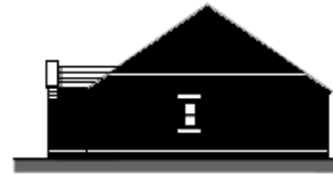
Plot 17: Bungalow Side Elevation