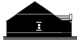
Plot 19: Bungalow Side Elevation